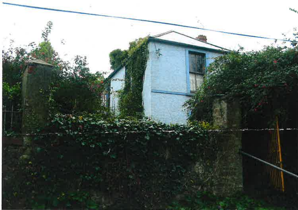
Photograph No. 1.4

Picture from Area Planner's Report on Adjoining Site dated 18/10/2007