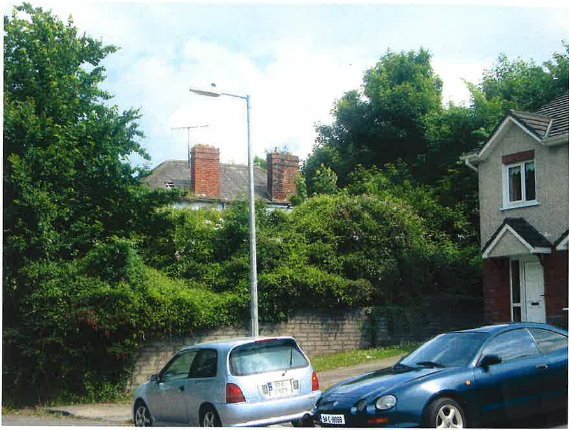
Photograph No. 1.2