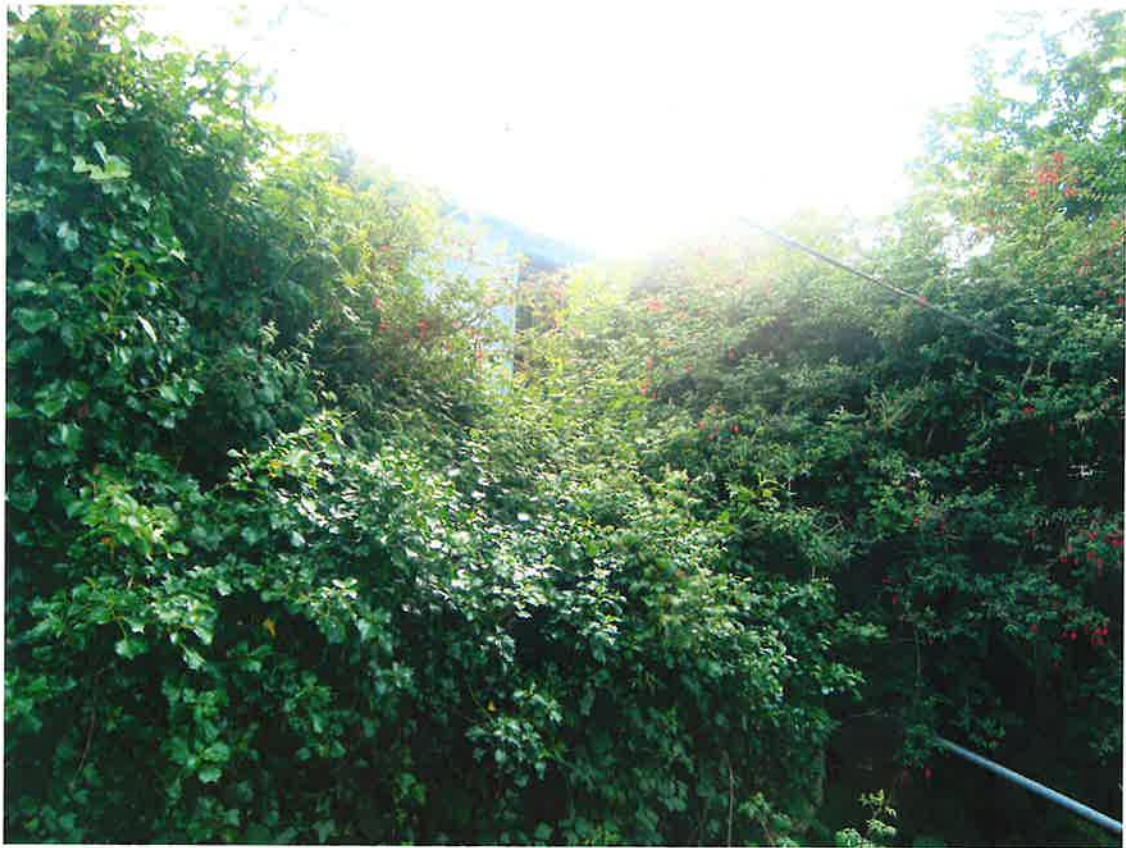
Photograph No. 1.1