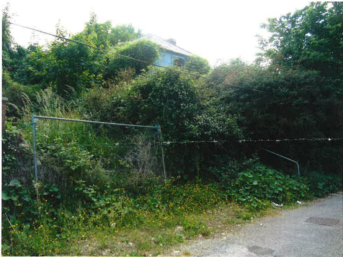
Photograph No. 1.3